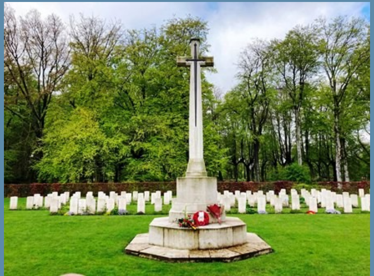
Commemoration at Schoonselhof Cemetery, Antwerp.